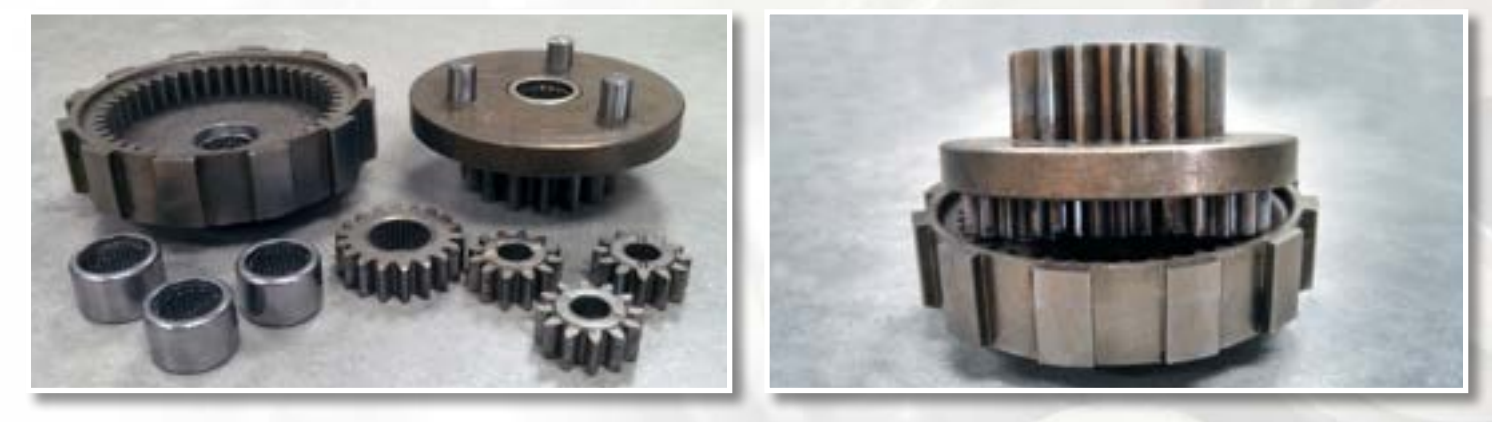
In-House Tumble (Grit) Blast Finishing Available

Value-Added Processing: Purchased part integration with multiple Sintergy powdered metal parts · Assembled in-house