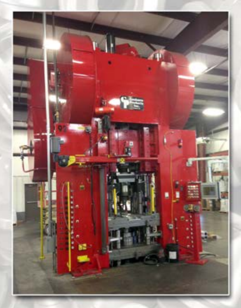
Gasbarre 750 Ton Powder Metal Press located at Sintergy's Reynoldsville, PA production facility.

Recently purchased and installed in April 2014, Sintergy's new Gasbarre 750 Ton Powder Metal Press broadly expands Sintergy's part size offering. Contact us to see if PM could be a solution even for some of your larger part needs.